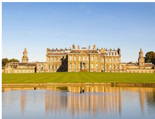
Picture 1. Hopetown-house castle

The central classical part and the west façade were made by architect William Bruce. The contrast east façade with the main colonnade arch, connecting the wings of the building with the central part is deliberately decorative and is considered to be one of the Adam's masterpieces (Pic. 2).