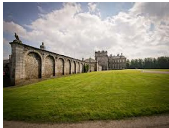
Picture 2. Hopetown-house castle

The inner staircase and the wooden trimming with incrustation in the form of flowers and fruit is the main peculiarity of the house. The handrails are carved from wood.